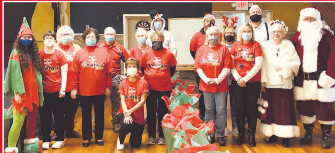
Members of the Slate Belt Chamber of Commerce Santa's Elves