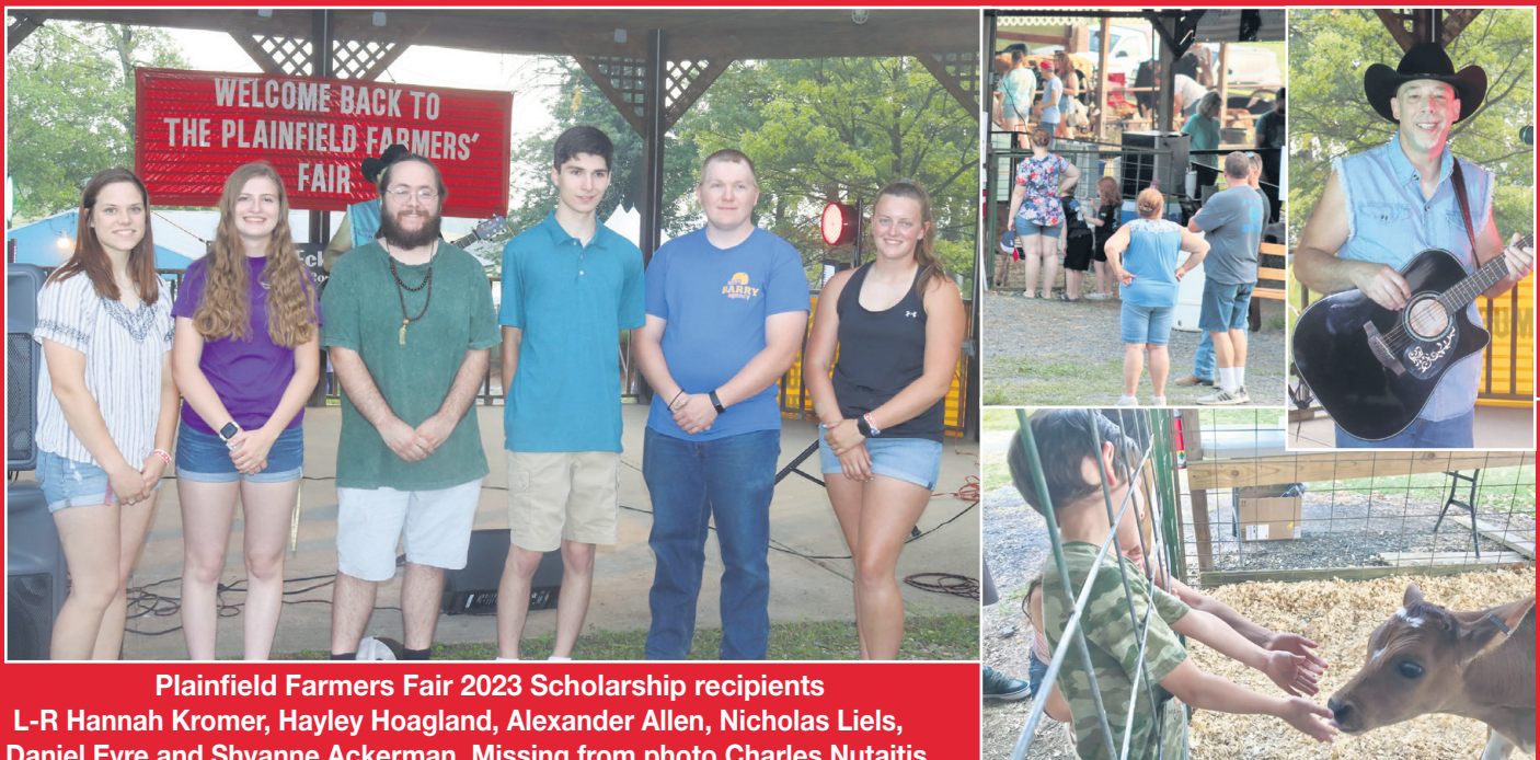
Plainfield Farmers Fair 2023 Scholarship recipients