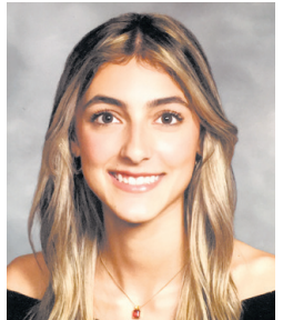
Isabella Reto Princess

The Annual "Big Time" dates back to 1893. The initial celebration was patterned after the festival that took place