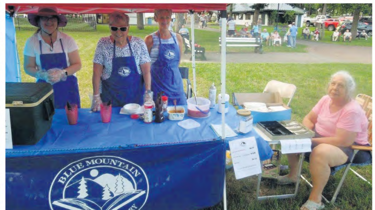
Members of the Blue Mt. Community Library sold "Make Your Own sundaes" at the Weona Park Summer Sounds Concert on June 23rd. The library will be back on August 6th at the Summer Sounds concert series at Weona Park. Please plan to come out and enjoy a beautiful night in Weona Park and support your Library.

Visit the library and check-out a good book to enjoy this summer. The Blue Mountain Community Library is located at 216 S. Robinson Ave. in Pen Argyl. Hours are Mon.-Sat, 10:00 AM to 12:00 PM, and Mon. and Thurs., 6:00-8:00 PM. Visit our website www.bmcl.org .