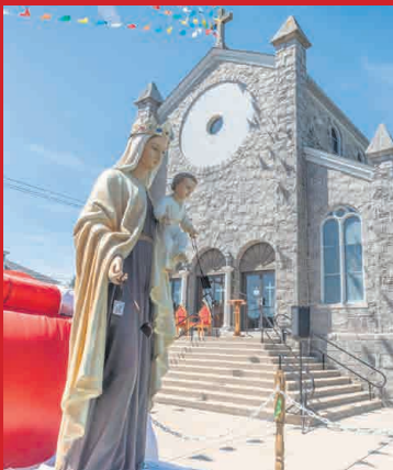
Our Lady of Mt Carmel