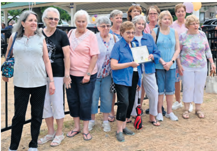
Pictured club members who attended the dedication ceremony.